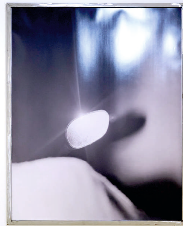
Untitled, 2023 C-Print, steel, engraving 121 x 147,5 cm

Born in Strasbourg Arthur Heck (b. 2000) is a visual artist based in Zürich traversing the entanglements of intimacy, social condition, and sexuality in his work. Rooted in a working-class upbringing Heck's visual production reflects a necessity of escape and a state of emergency musing over the relation between body and changes in space.