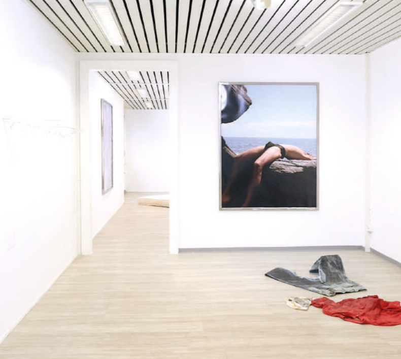
Untitled, 2023 C-Print, steel, engraving 117,5 x 147,5 cm

«This is one of those incandescent love stories. A fiery love in a burning world. A story of passion in a forrest signed by tears running down its cheeks. A cry for love when nothing holds together anymore. Emerged from deep sadness. A damaged love in a damaged world. These are the politics of melancholy through the ass.»