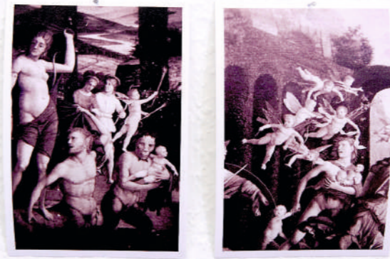
Minerve Chassant les Vices du jardin de la Vertu, 2022 Digital print 10 x 15 cm