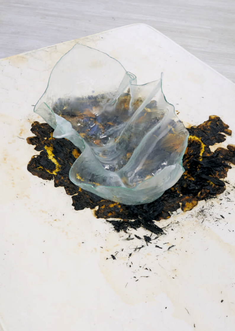
Untitled, 2023 Matress, Glass 160 x 200 cm