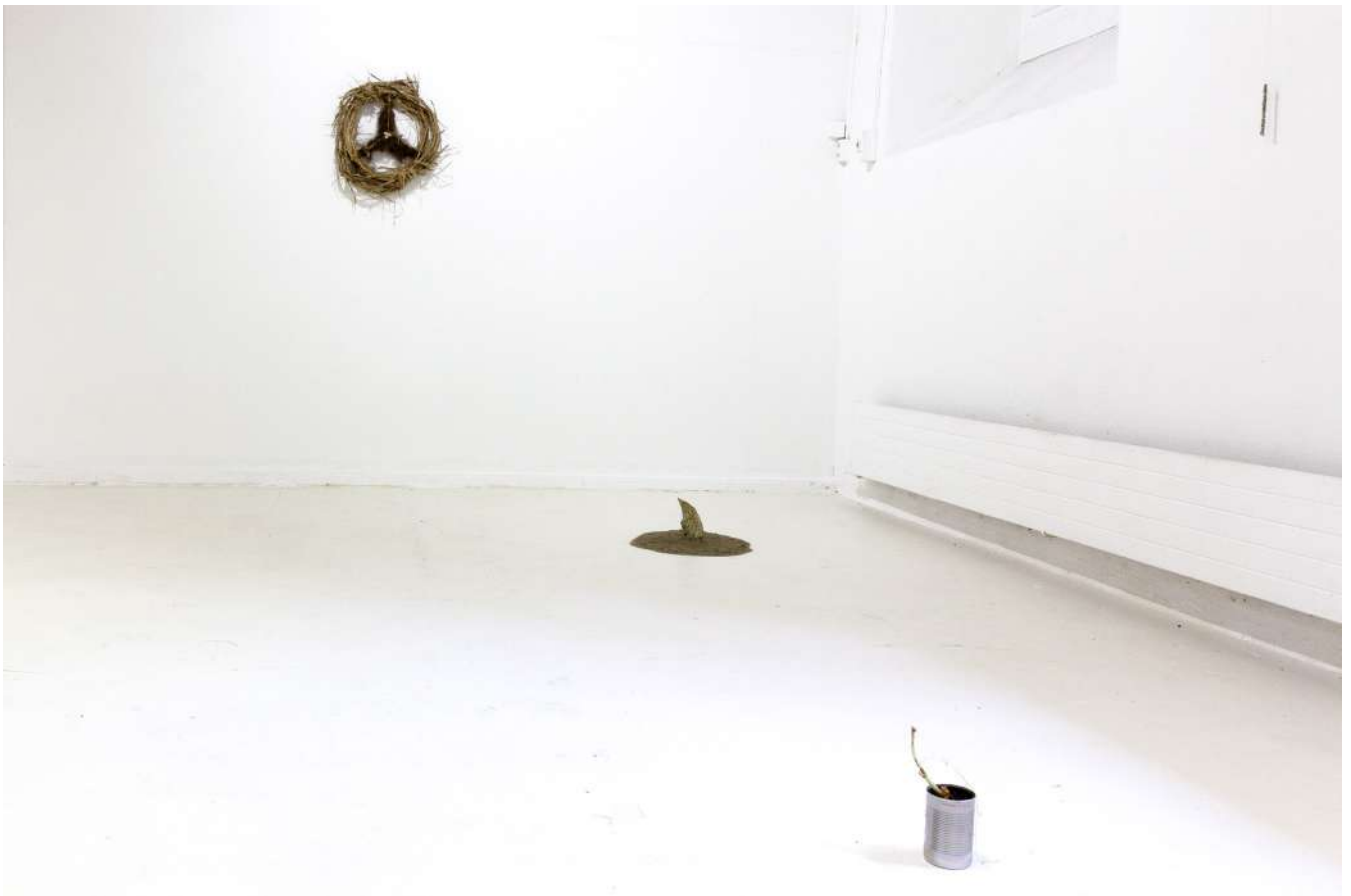
Ivana Jurisic, install view, Offspace Flüelastrasse, Zurich, 2022