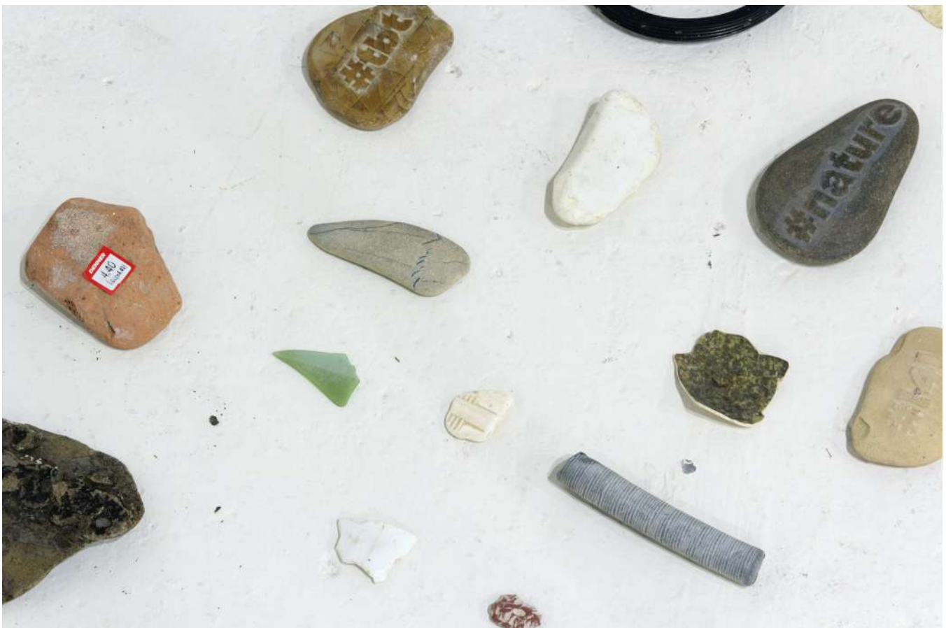
IVANA JURISIC #Töss, 2022 23 Objects various size Stone, wood, plastic, ceramic, rubber, metal