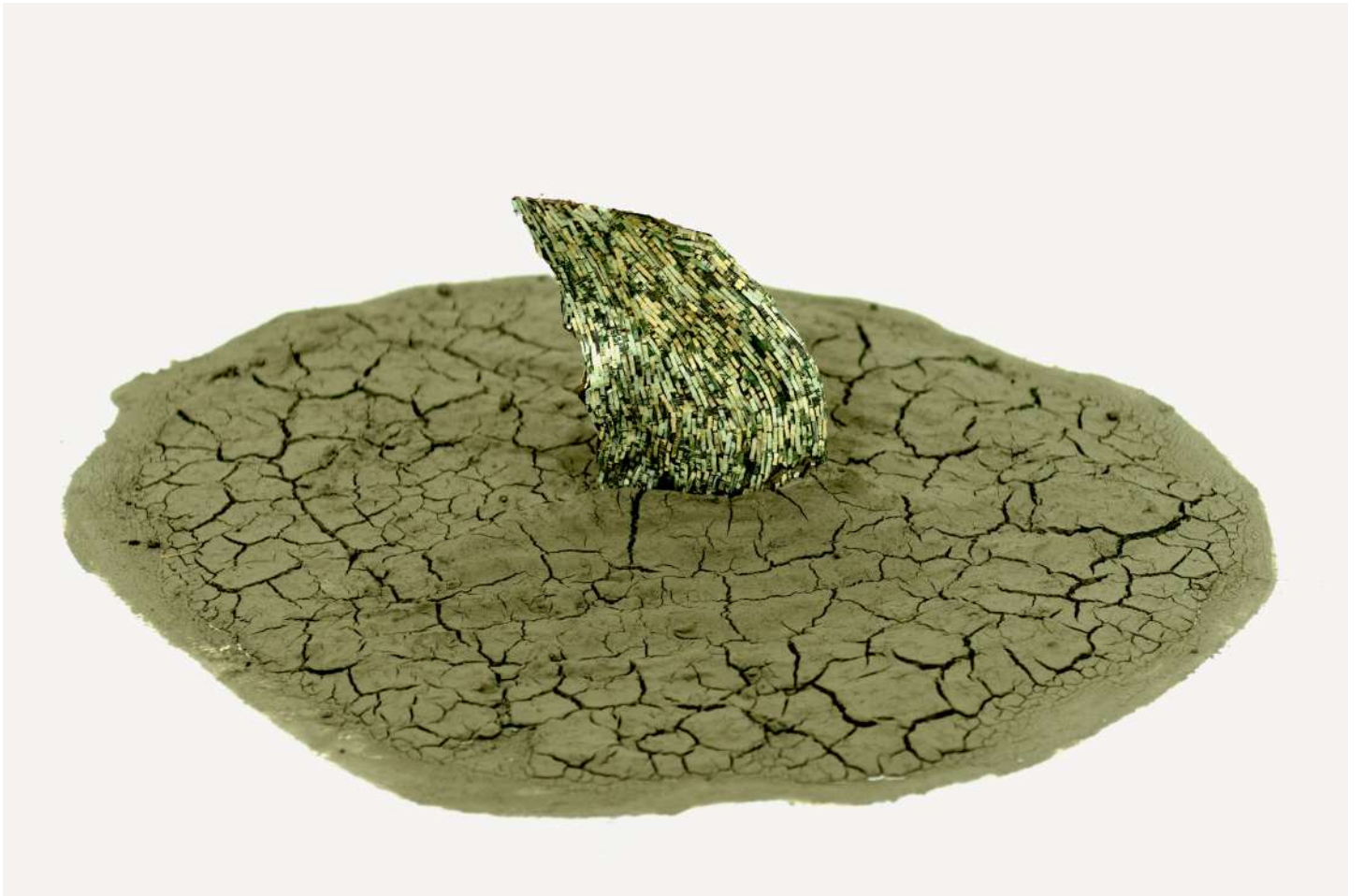
IVANA JURISIC Shark , 2022 Sculpture 57x47x17cm Ash, soil, wood, dollar