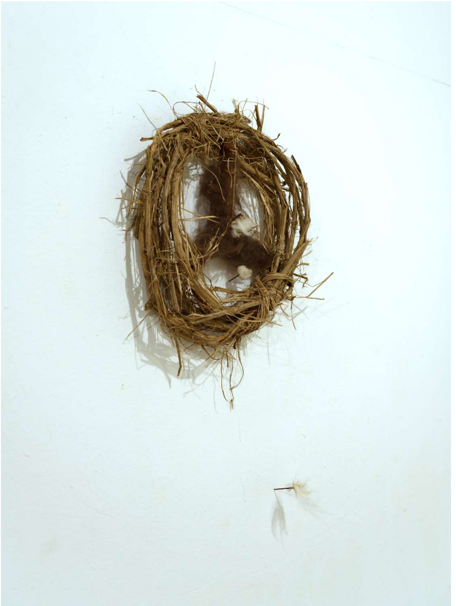
IVANA JURISIC AMG, 2022 Sculpture 50x50x10cm Nettle, Japanese knotweed, hemp