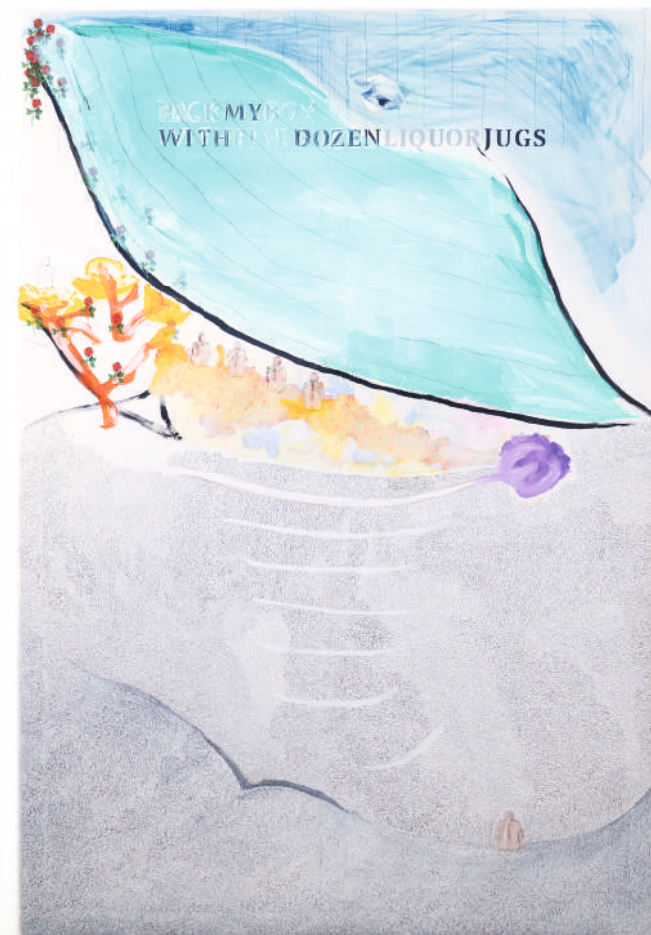
RSVP (Roses to Whales), 2024 Acrylic, pastel, stickers, ink on canvas 100 cm x 145 cm