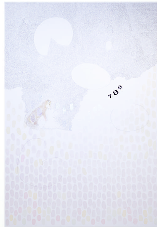
WWW (World Wide Web), 2024 Acrylic on canvas 100 cm x 145 cm