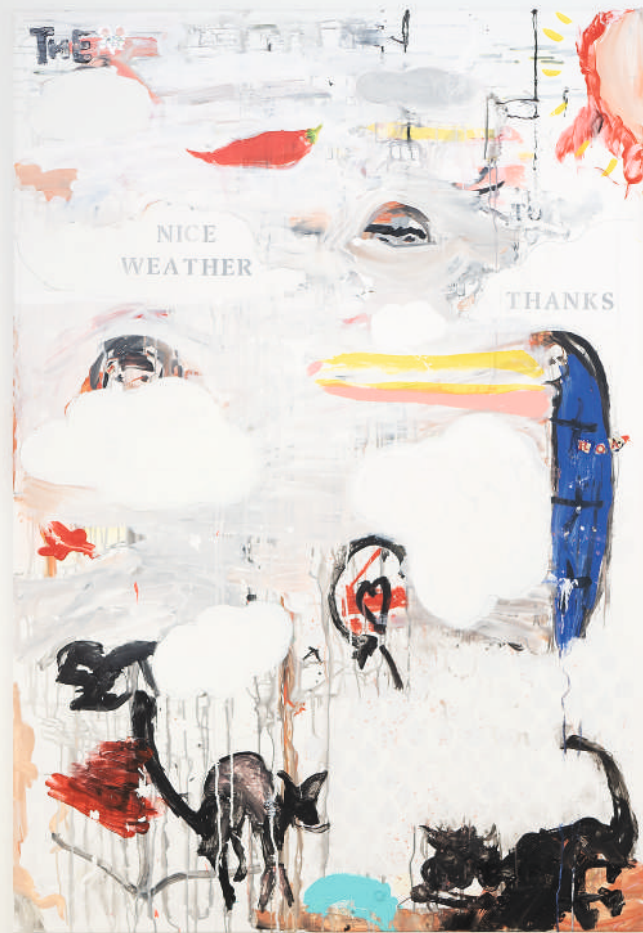
GOT (GOod Talk), 2024 Acrylic, pastel, gel, ink on canvas 100 cm x 145 cm