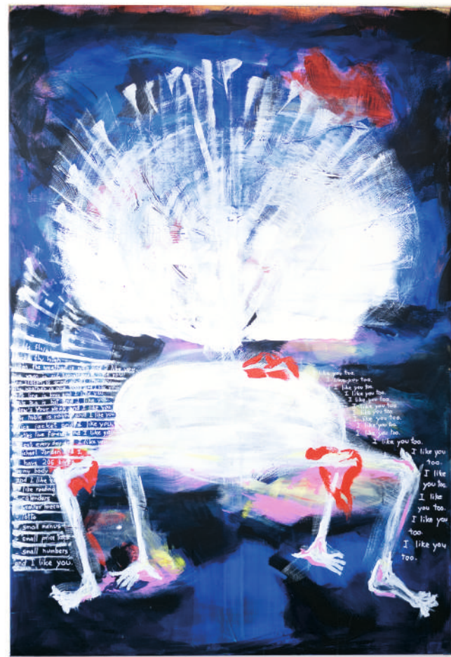
BU (Bottoms Up), 2024 Acrylic, ink on canvas 100 cm x 145 cm